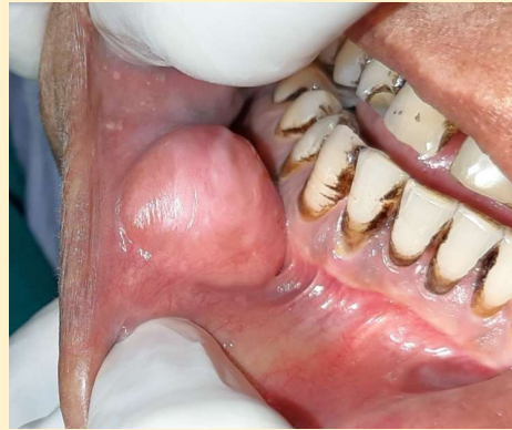
Figure 1: Dome shaped soft tissue swelling on retrocommisure area in relation to 43-45 region.