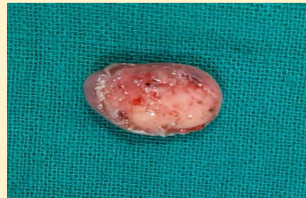
Figure 2: Gross examination of excised tissue.